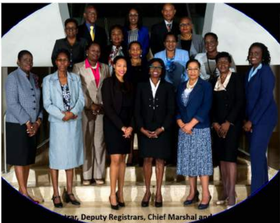
The Registrar, Deputy Registrars, Chief Marshal and other Senior Officers of the Registry Department