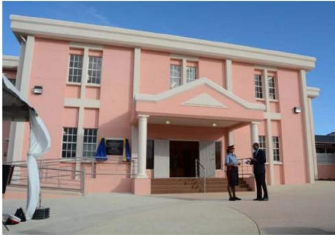
The Cane Garden Police Station & District 'D' and 'F' Magistrate's Courts was opened on 25 February 2018.