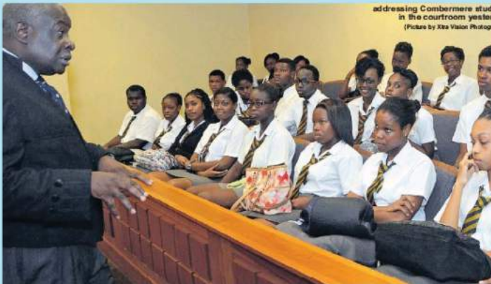
The Chief Justice (left), Sir Marston Gibson addressing Combermere students

The Judiciary of Barbados supports education outside the classroom. Schools frequently visit the law courts to be educated on the system of justice. Since the introduction of the Law programme at the Combermere School in 2014, Law and Caribbean Studies students annually visit the Supreme Court. Students would sit in on cases in the Court of Appeal, Criminal and Magistrates Courts and be educated on the structure and procedure of the court system, operation of the system of justice, alternative dispute resolution, the drug treatment court, amongst many other topics.