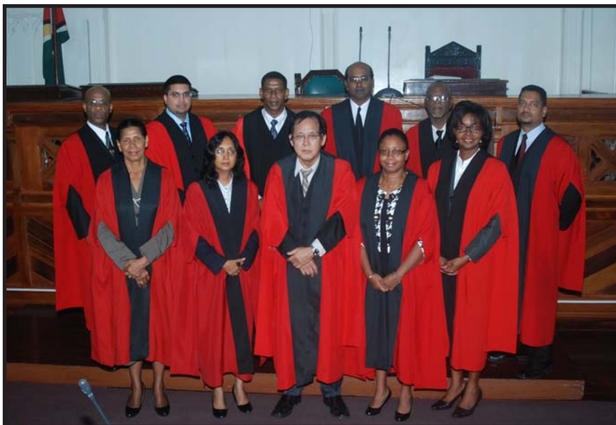
Judges of the High Court of the Supreme Court of Judicature, Guyana

magistracy currently comprises of the Chief Magistrate and an authorized strength of twenty-one magistrates sitting in twenty-one magisterial districts. While some magistrates are resident in their magisterial districts, others such as those assigned to interior and rural courts, travel to these districts to preside on an itinerant basis. A number of enactments over the years concretised the jurisdiction of the magistrates' courts culminating in the Magistrates' Court Ordinance, No. 13 of 1893, now the Summary Jurisdiction (Magistrates) Act, Chapter 3:05. Both the District Courts Ordinance, No. 30 of 1961 and the Administration of Justice Act, 1978 gave the magistrates jurisdiction to try a number of serious offences which were originally heard on indictment only. This jurisdiction which is to be exercised with the consent of the accused, does not involve a preliminary inquiry but the accused is supplied with the statements of the witnesses who are going to be called to testify on behalf of the prosecution. As such, about 90% of criminal matters are dealt with in the magistrates' courts..