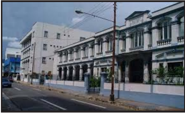
The Magistrates' Court, Port of Spain, Trinidad